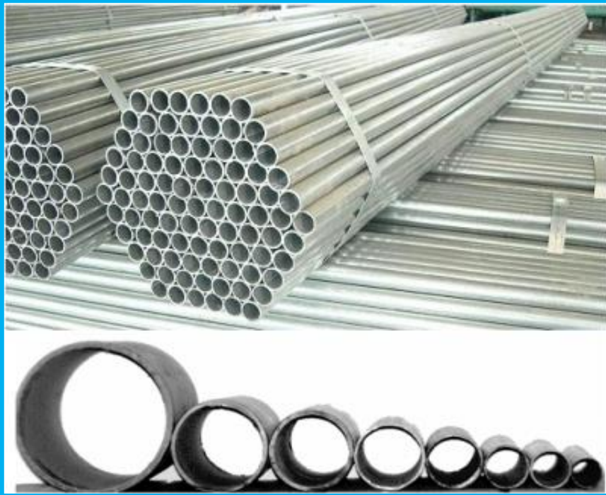
114.00 mm OD.

Premium OZ fence framework from reputed pipes manufacturers from GCC Factories is made from cold-rolled steel for all commercial, industrial, and high security fence applications.